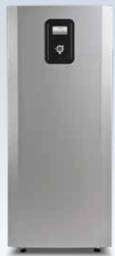
Mega L and Mega XL

Energy class according to Eco-design Directive 811/2013