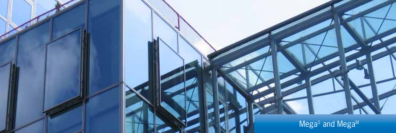
Mega S and Mega M